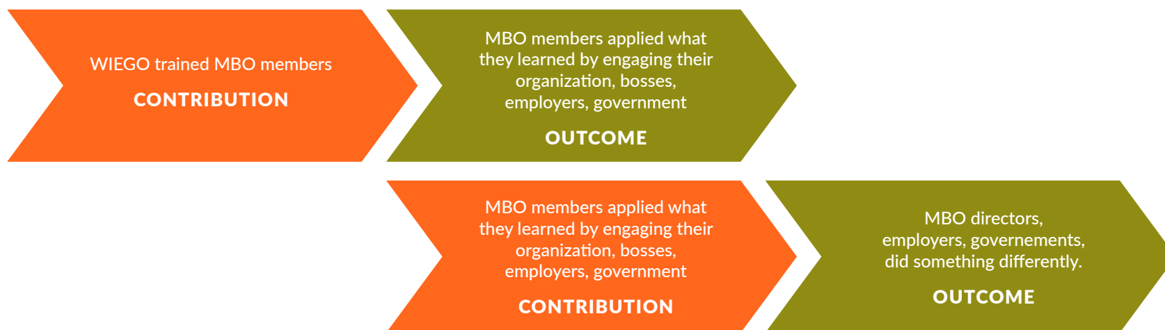
Figure: An early outcome becomes a contribution to a later outcome

NOTE to facilitator: In this case the first outcome, that is the action taken by the workshop participant, described in Part 3, which influenced the outcome written in Part 6, becomes the contribution to this outcome in Part 6. So, it starts as an outcome in Part 3 and then, in turn, influences (i.e., contributes towards) another outcome. After today's workshop, that decision maker or whoever is the WHO in the outcome above, may take yet another step. In this way, you generate a chain of outcomes, a story of change, in which WIEGO is an indirect contributor.